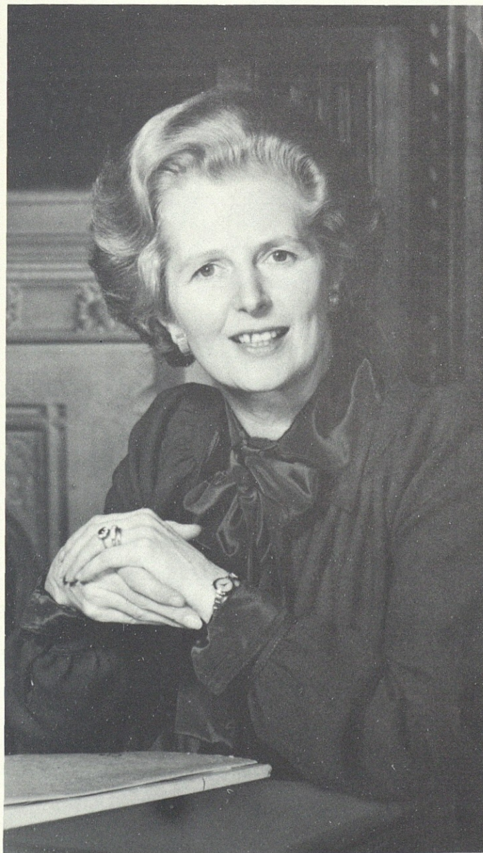
The Rt Hon Margaret Thatcher, M.P. Prime Minister